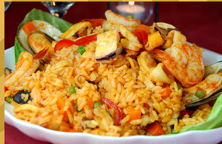
Arroz con Mariscos