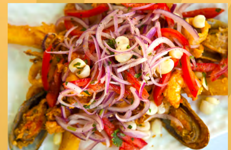
Jalea de Mariscos