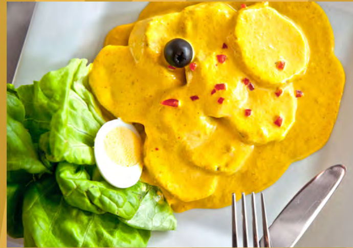
Papa a la Huancaína