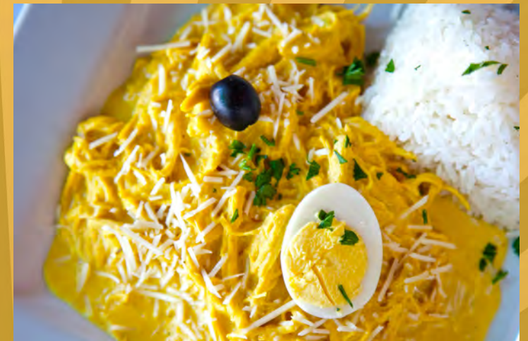
Ají de Gallina