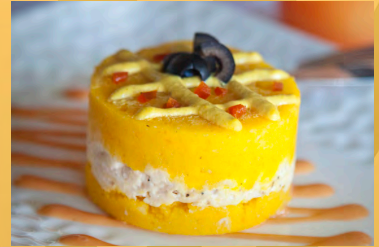
Causa Rellena de Pollo