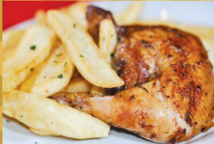
Pollo a la Brasa