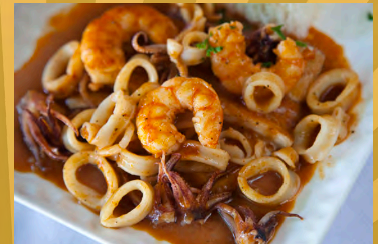
Pescado a lo Macho