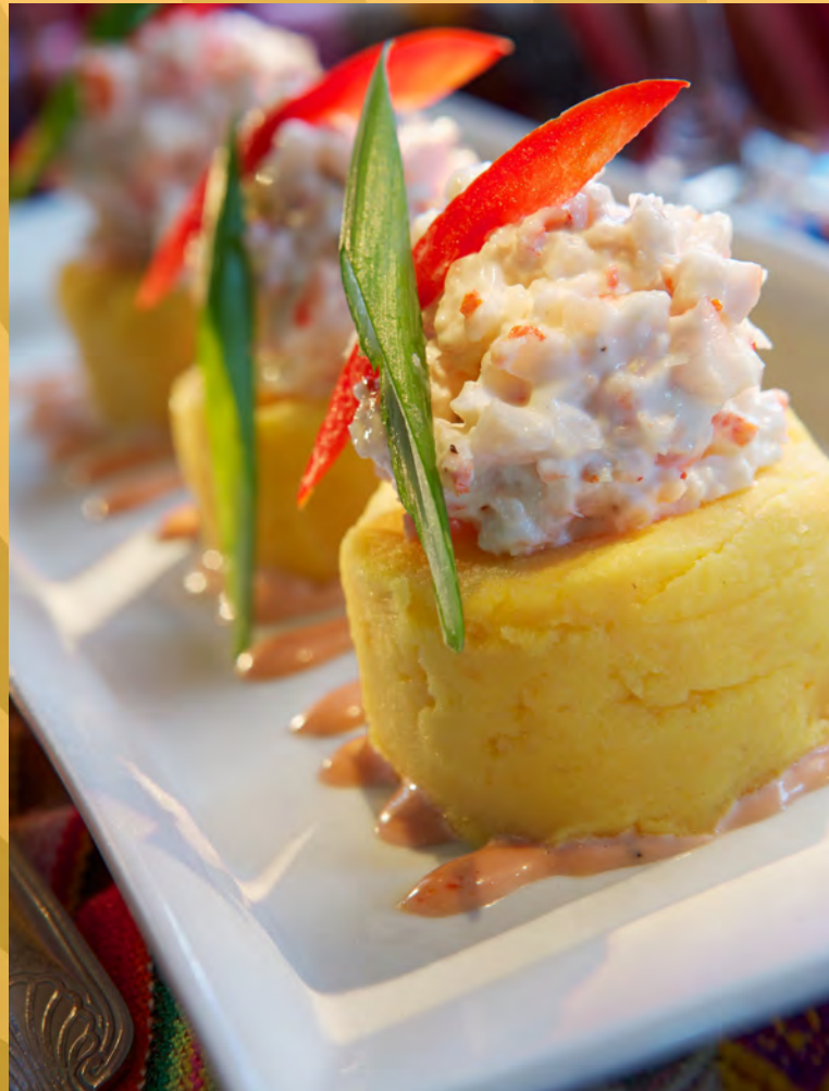
Causa Rellena de Camarón