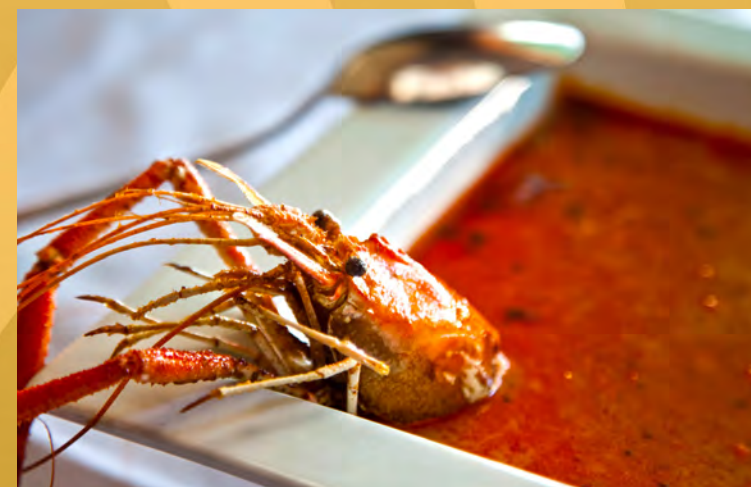
Chupe de Camarón