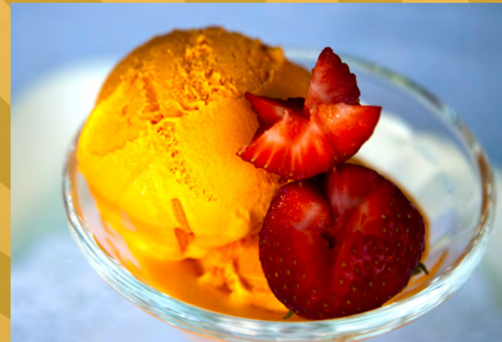
Helado de Lúcumá